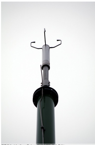
DWD Wetterstation Nossen/Sachsen - Bild 21.8.2011